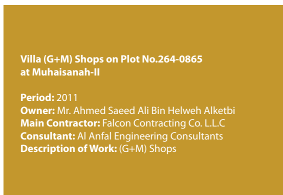
Villa (G+M) Shops on Plot No.264-0865 at Muhaisanah-II