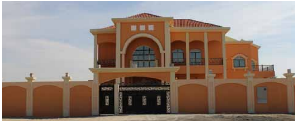
Villa (G+1) Villa on Plot No.263-1293 at Al Mezhar-II