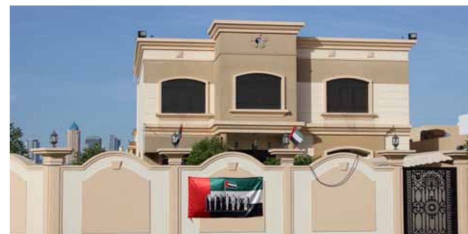
Villa (G+1) Villa on Plot No.355-881 at Al Quoz-II